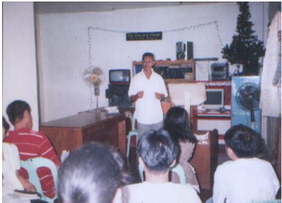
The word of God being taught in Cagayan de Oro City, Philippines

For Past Weeks Lessons go to http:// cocwem.4shared. com