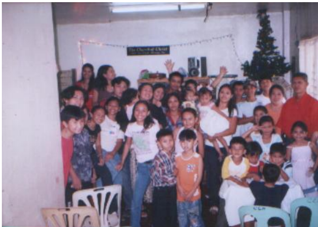
Church members in Cagayan de Oro City, Philippines