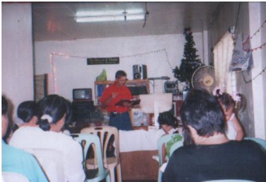
The word of God being taught in Cagayan de Oro City, Philippines

We think a lot of things that seem right and good to us and sometimes we will read something in the scriptures that would seem to verify what we would think. We take that and base our belief on that. Not going ahead and searching the rest of the scriptures to see what it has to say about it. When we do we find oftentimes that the scriptures contradict what we have concluded which makes it necessary that we come to a whole different conclusion based on the scripture not our own thoughts.